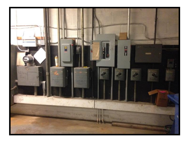
Gill Elementary School – basement wall full of older and newer electrical panels and disconnects. (Main panel is partially visible at the far left of the photo.)

Photograph of wheelchair ramp at Riverside Building to be inserted above.