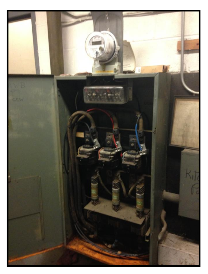
Gill Elementary School – main electrical panel