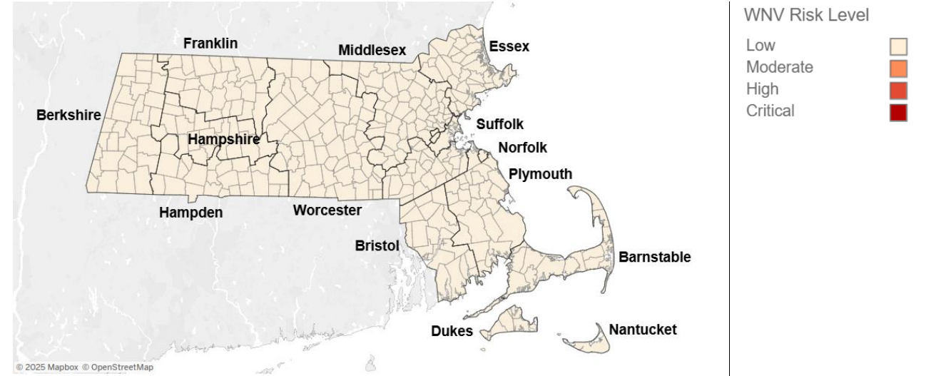
WNV Risk Map as of 6/27/25 – No Change

Current WNV Risk Map