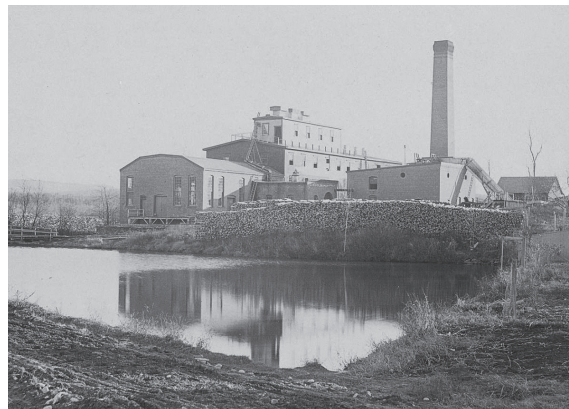
New England Fibre Mill, Riverside, 1886-1901