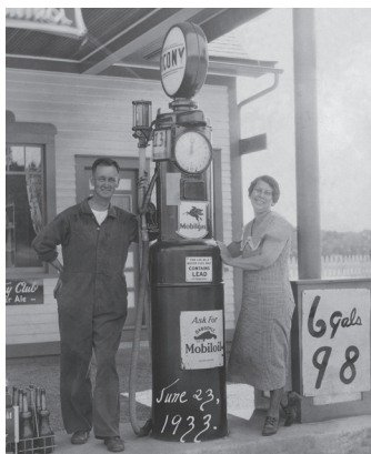
The Crawfords at their store, 1933.