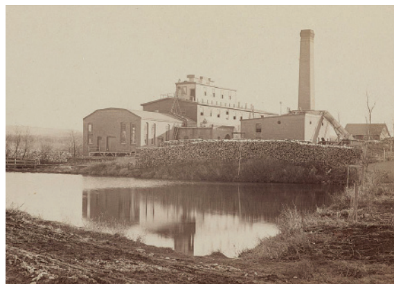
New England Fibre Mill, Riverside, 1886–1901