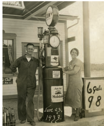
The Crawfords at their store, 1933.