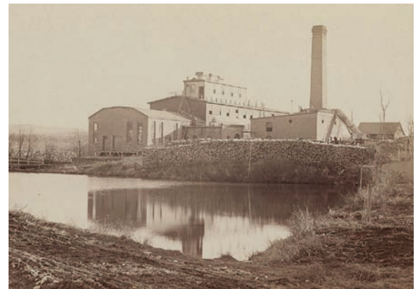
New England Fibre Mill, Riverside, 1886-1901