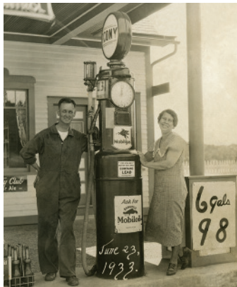
The Crawfords at their store, 1933.