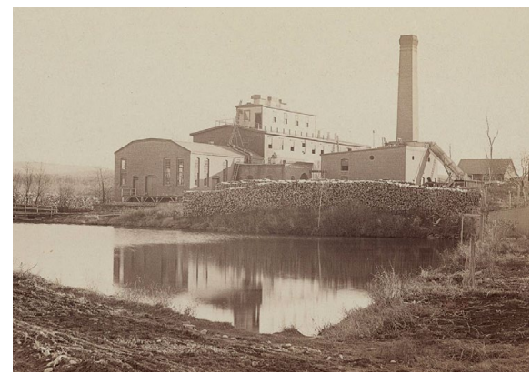
New England Fibre Mill, Riverside, 1886–1901