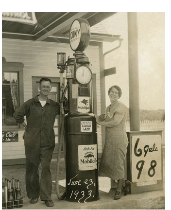
The Crawfords at their store, 1933.