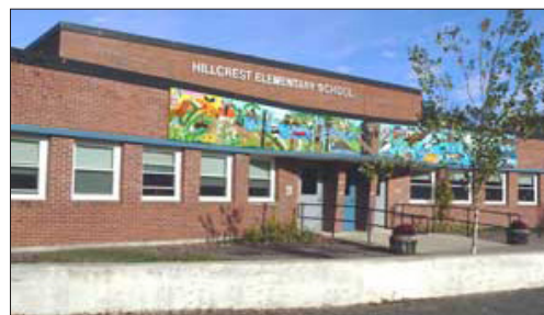
Hillcrest Elementary School