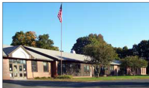
Gill Elementary School