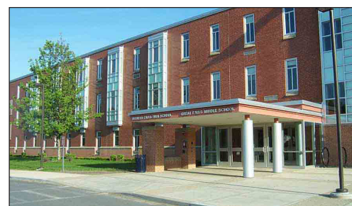
Turners Falls High School/Great Falls Middle School